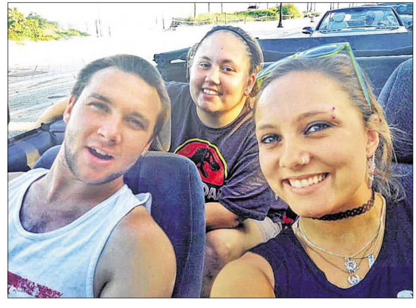
teenagers pulling in and out of the driveway.

In 2015, a person died every other day of a heroin-related overdose in Palm Beach County